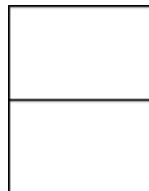
1/2 page (7"x4.6875") $100