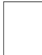
Full page (8.5"x11") $150